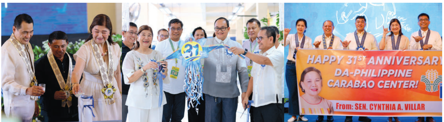
Some of the highlights of the agency's island cluster anniversary celebrations include symbolic act of unity, exhibit, and recognition of industry partners.

The event also featured an exhibition showcasing the diverse products derived from carabaos, including hide, meat, and dairy delicacies. B