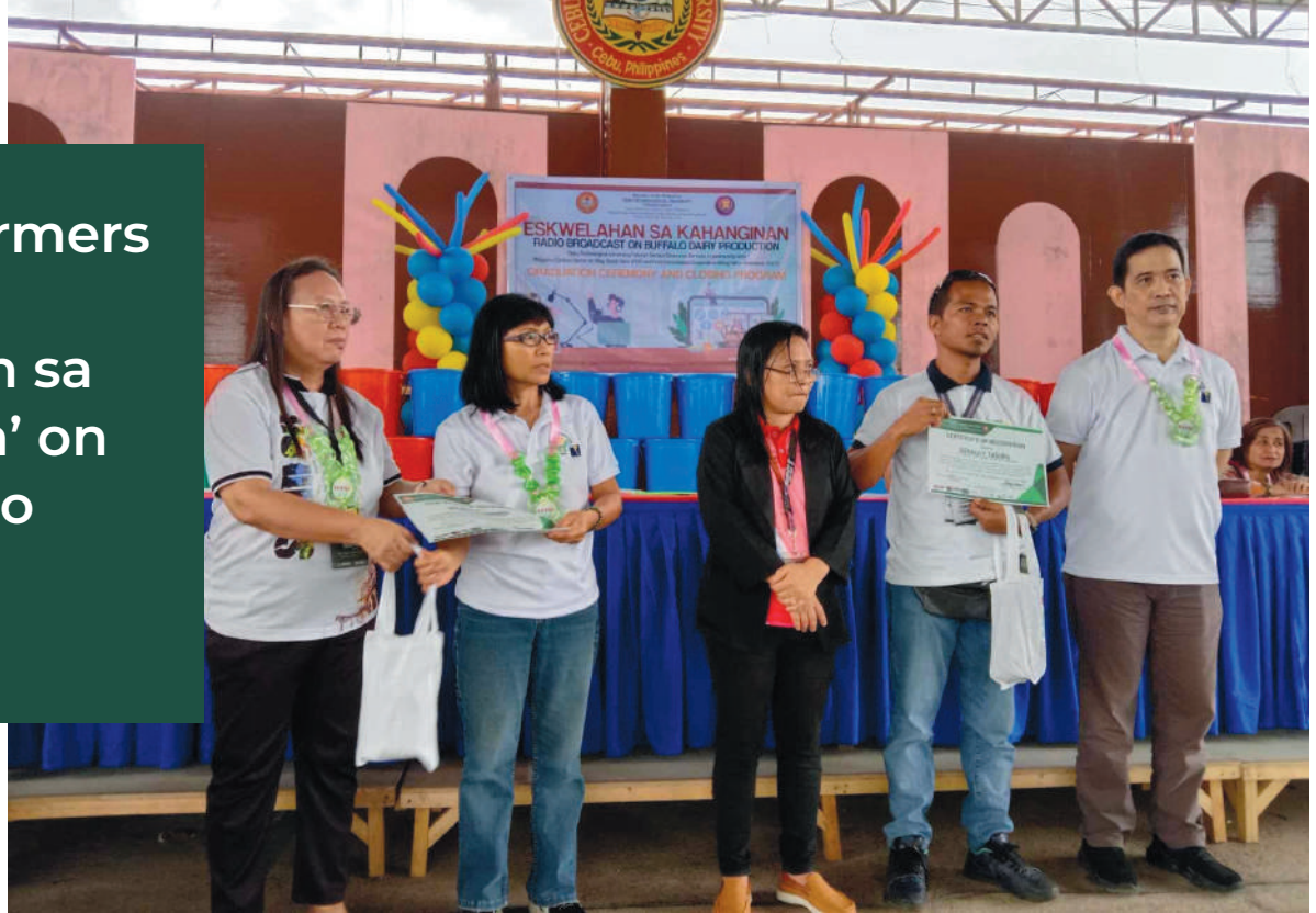
Recognition rites for SOA completers in Tuburan, Cebu.

Cebuano farmers in the northern part of Cebu recently celebrated the graduation of 230 individuals from the Eskwelahan sa Kahanginan (School-on-the-Air): Radio Broadcast on Dairy Buffalo Production. The ceremony took place on January 22 at Cebu Technological University (CTU)-Tuburan.