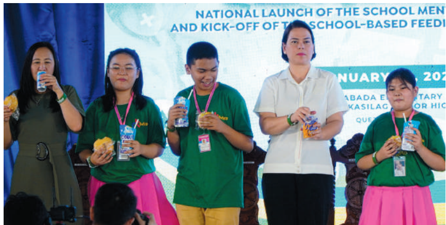
Vice President Sarah Duterte alongside other officials and students showcase and enjoy DA-PCC's sterilized carabao's milk and Karabun during the program.

The kick-off includes the provision of one fortified meal to all undernourished public school children from kindergarten to sixth grade over a period of not less than 120 days in a year. B